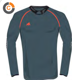
CHARCOAL : RED : BLACK

FABRIC DRYFIT + TEAM MESH SIZES JUNIOR (YS; YM; YL) SENIOR (SML; MED; LGE; XL)