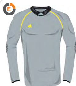
GREY : YELLOW : BLACK