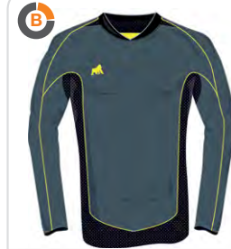
CHARCOAL : YELLOW : BLACK