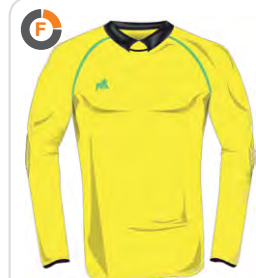
YELLOW : EMERALD : BLACK