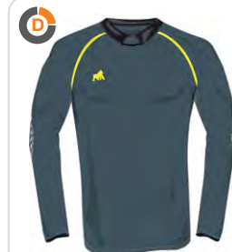
CHARCOAL : YELLOW : BLACK