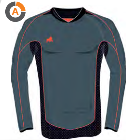
CHARCOAL : RED : BLACK

//REFER TO WHOLESALE PRICE LIST FOR COSTS